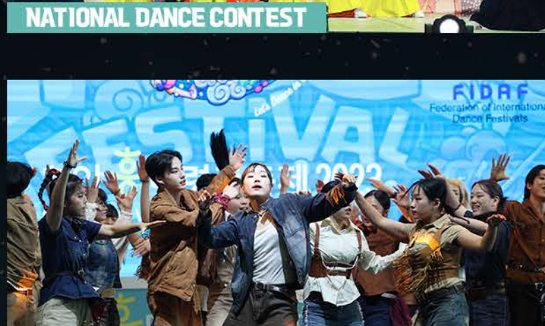
FIDAF GENERAL CONGRESS