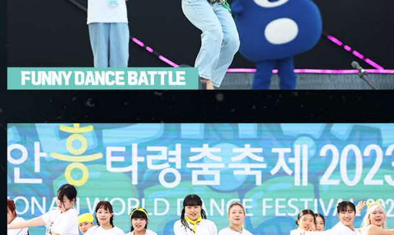
INTERNATIONAL DANCE COMPETITION