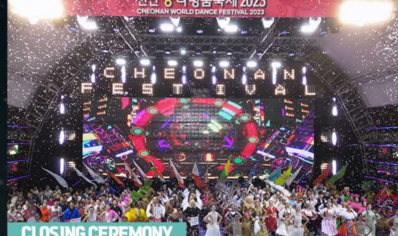
NATIONAL DANCE CONTEST