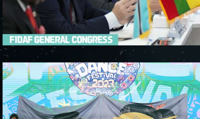
STREET DANCE PARADE