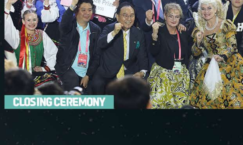
KOREA INTERNATIONAL CONTEMPORARY DANCE COMPETITION