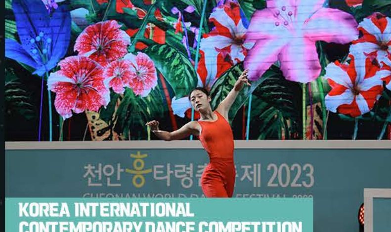
NATIONAL DANCE CONTEST