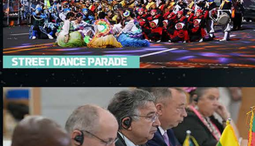
STREET DANCE PARADE