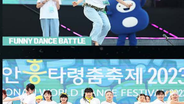
FUNNY DANCE BATTLE