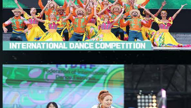
INTERNATIONAL DANCE COMPETITION