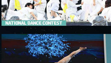
NATIONAL DANCE CONTEST