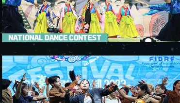
NATIONAL DANCE CONTEST