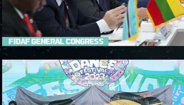
FIDAF GENERAL CONGRESS